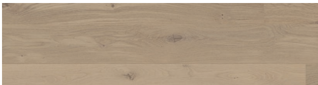
Cliff Grey Oak