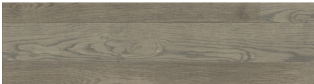
Slate Grey Oak Extra Matt