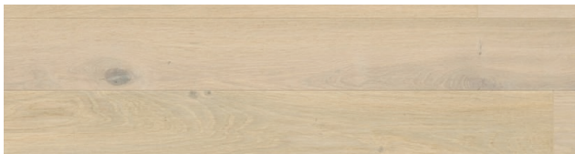
Wintry Forest Oak Extra Matt