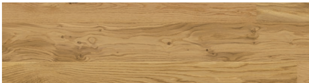
Natural Oak Extra Matt